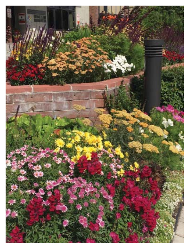
Pioneer Home plantings