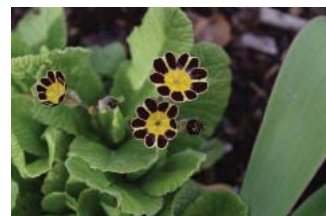
P. polyanthus 'Gold Lace'