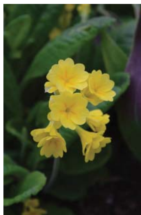
Primula veris - Hose in Hose