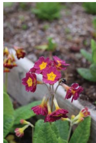
P. veris 'Lord Alfred'