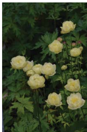
Trollius "New Moon"