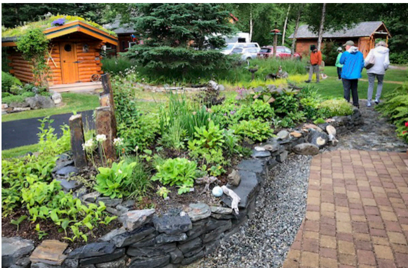
Exploring Madge Oswald's extensive grounds. Even the log cabin sports a rooftop garden.