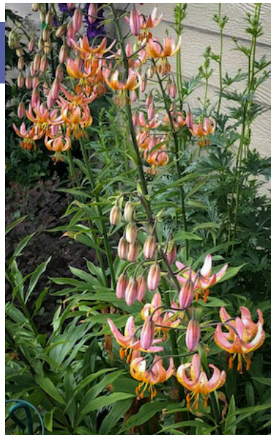
Many of the plants in Madge Oswald's garden were divisions from other gardeners. Her landscape features a wide variety of Martagon lilies, Lilium martagon hybrids, ranging in color from this blush peach to deep merlot.

Please contact Fran Durner for yellow plant tags. Plants should be labeled to ensure best use by the purchaser! For more information contact Fran: durner1@gmail.com