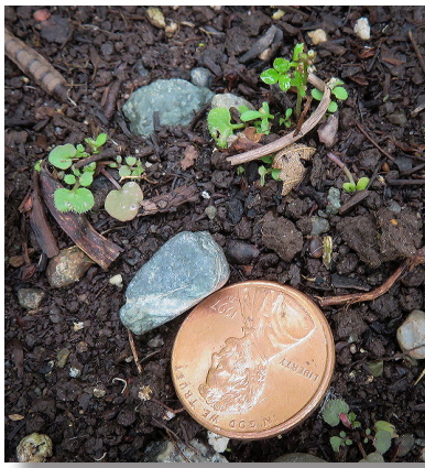
Pop-it weed.