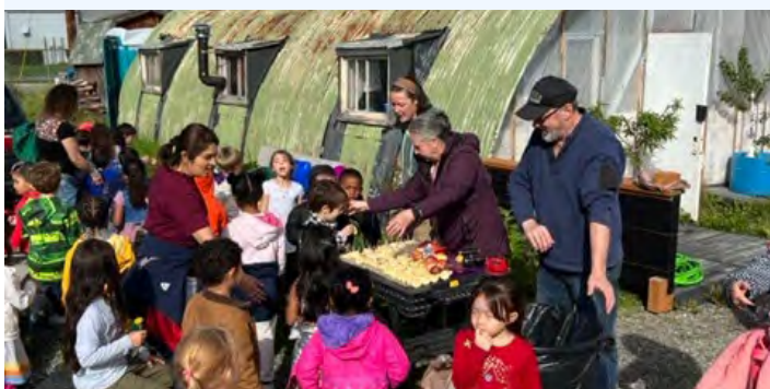
ASWCD and volunteers helped with an apple tasting for students at the Government Hill Orchard.