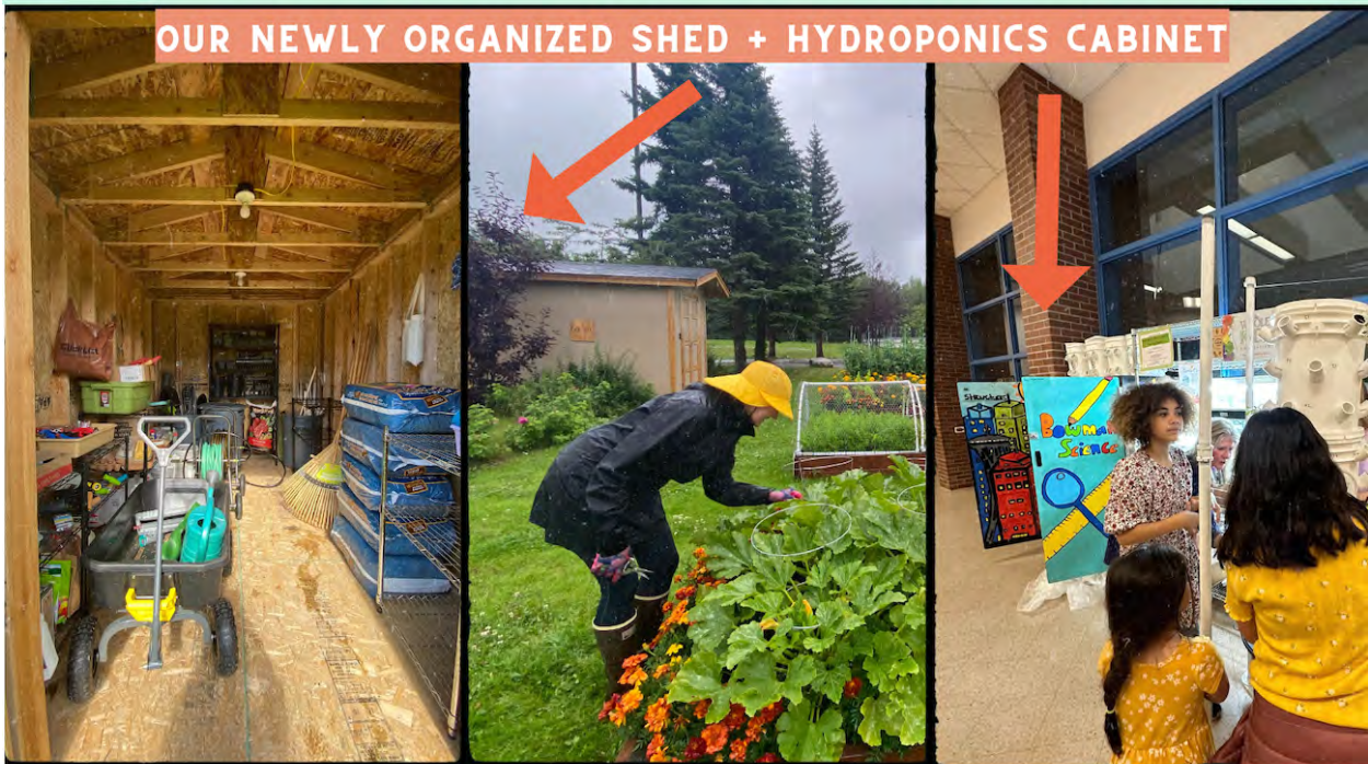
OUR NEWLY ORGANIZED SHED + HYDROPONICS CABINET

FOR MORE INFORMATION VISIT BIT.LY/BOWMANGARDEN