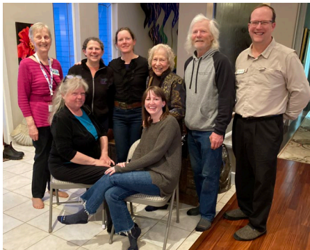
Thank you to our conference committee!

A few highlights from our evaluations: attendees enjoyed our speakers. Alaska has a very talented pool of gardening experts, and perhaps it's no longer necessary to look out of state for our next keynote. The Friday night event was very successful, and having the silent auction then helped keep the Saturday focus on education. The auction, which required a lot of organizational work,