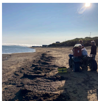
Left to right: Building raised beds in Elim and harvesting “beach peat” in Golovin.

bagged soil or amendments is very expensive. Cheryl Thompson, a gardening teacher in Nome, swears by a recipe of one-third native soil, one-third sand, and one-third compost. However, collecting native soil can be hard, and composting in bona fide bear country is