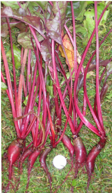
Sharon's beets, pictured next to a quarter.

AND HOW WAS YOUR SUMMER... As crappy as it was for those of us who like to sit on the deck and pretend we're working, gardening reports reaching BC are wildly mixed. Super gardener Sharon Schlicht's review could make strong dirt lovers weep: