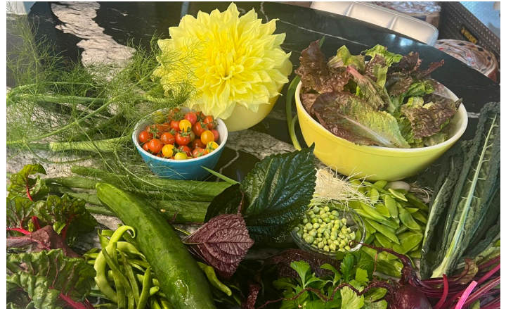
Diane Kaplan's lush garden harvest.

“My worst tomato-growing season ever!... Only about one-quarter of my pea seeds germinated...Onions that are usually baseball-size look more like scallions...More than half of my broccoli, cabbage and cauliflower plants died before they had a chance to mature. It was likely due to root maggots...beets that grew about 6” long...in past years are about the size of my thumb.”