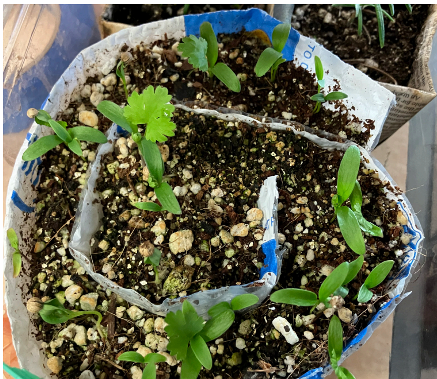
Go to YouTube and look up how to make a "seed snail." This garden trend is an innovation in seed starting!