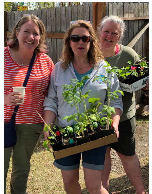
Happy swappers at last year's seedling exchange!

Take: Anything you see that you want for your own garden! After the event, all excess seedlings and garden supplies, etc. will be donated to Yarducopia's Community Garden and Midtown Garden Depot at Benson Blvd. & Cheechako St.