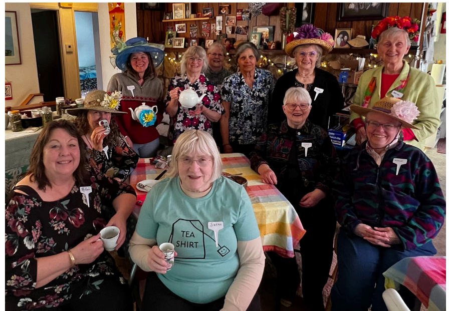
Herb Study tea party attendees. Yes, plant tags for name tags!

The Herb Study Group picks one herb per month for a deep dive and knowledge exchange. See previous newsletters for articles about studied herbs. The last spring meeting of the Herb Study Group will be a plant exchange on May 8th. All are welcome! Email: anchorageherbstudygroup@gmail.com .