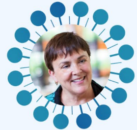
ELLEN ZACHOS The Wildcrafted Cocktail Backyard Foraging

10 Speakers · Lunch 8:30-5:00 at UAA $120